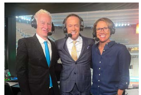
Tennis Anyone? -- Flanked by John McEnroe and Mary Carillo, our own Dan Hicks superbly anchored NBC's broadcast of the 2022 French Open at Roland – Garros, Paris.