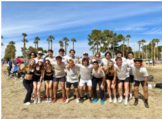
Our members gathered over winter break 2022 in Bariloche, Argentina.