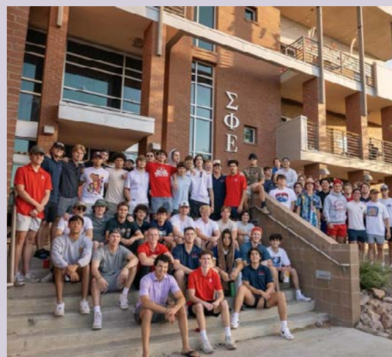
Current members (whole house)