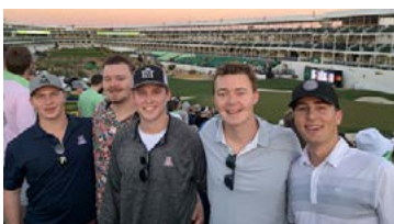
Brothers and recent alumni gathering at the Phoenix open to network and appreciate the game.