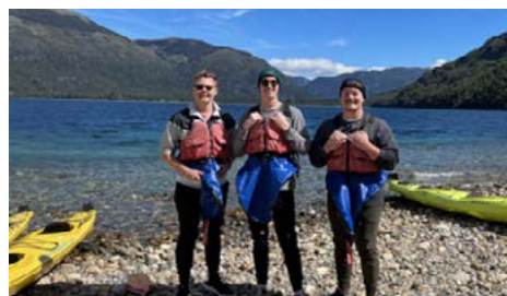
Three of our members got the chance to kayak in Argentina over this past winter break.