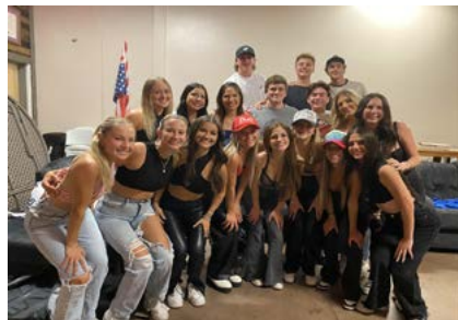
Sigma Phi Epsilon's sweetheart week.