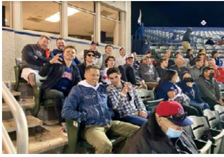
Members participating in the Alpha Phifa soccer philanthropy event. Here they are pictured with their coaches.